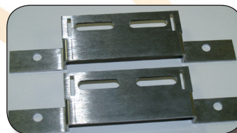
Universal Stainless Steel Mounting Brackets